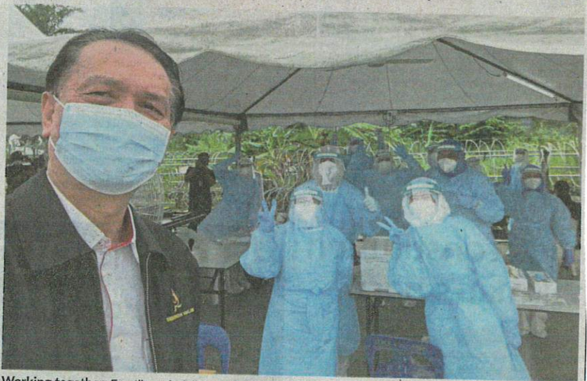
Working together: Frontliners in full protective gear looking upbeat as they pose with Noor Hisham at one of their operation-posts in Meru, Klang.

Frontliners in their personal protective equipment also took the opportunity to take photos with Dr Noor Hisham during his visit.