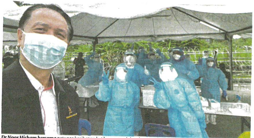
Dr Noor Hisham bersama petugas kesihatan ketika mengadakan lawatan kerja ke kawasan PKPD Jalan Teratai, Klang, semalam.