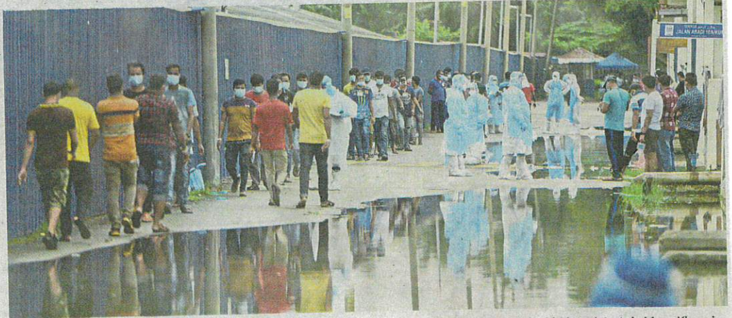
Weather challenge: Medical frontliners monitoring residents and foreign factory workers going for Covid-19 swab tests in Meru, Klang, in the midst of a flash flood.

“Thirty-nine people were screened, of whom 12 tested positive,” he said.