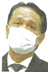
Tan Sri Dr Noor Hisham Abdullah

"At the moment, 10,923 returnees are in quarantine, while 405 have been admitted to hospitals."