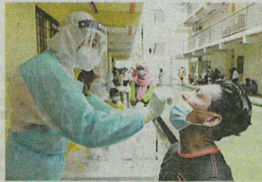
Anggota Jabatan Kesihatan Negeri Sabah membuat saringan Covid-19 terhadap penduduk Taman Telipok Ria, Kota Kinabalu yang dikenakan Perintah Kawalan Pergerakan Diperketatkan (PKPD) bermula kelmarin.

Beliau berkata, terdapat empat kematian berkaitan Co-